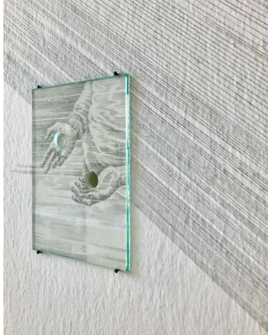
Sandra Boeschstein Ohne Titel, 2023 (Detail)

In 2024, 'Dazwischensein' will provide the intellectual superstructure for nine short, individual artistic presentations that examine the topic in its various aspects. Being in between can be a thought, state or even a feeling. We want to understand being in between as an opportunity to see more and to grasp different perspectives at the same time.